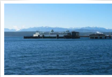
port townsend ferry

Washington has snow-capped mountains, resident orca pods, a rainforest and the odd vampire and werewolf. There are endless opportunities for mini-vacations, from wild places to wild adventures. See bald eagles or sit by a fire gazing off into the Cascades. Try a wine-tasting or stroll through a quaint seaport. For a weekend or a week, you can find something novel and relaxing to do in Washington.